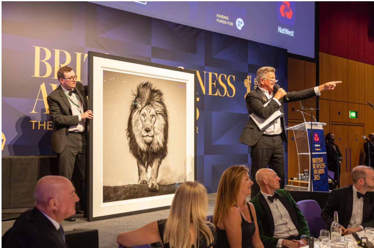
'In The Line of Fire' sold twice at £55,000