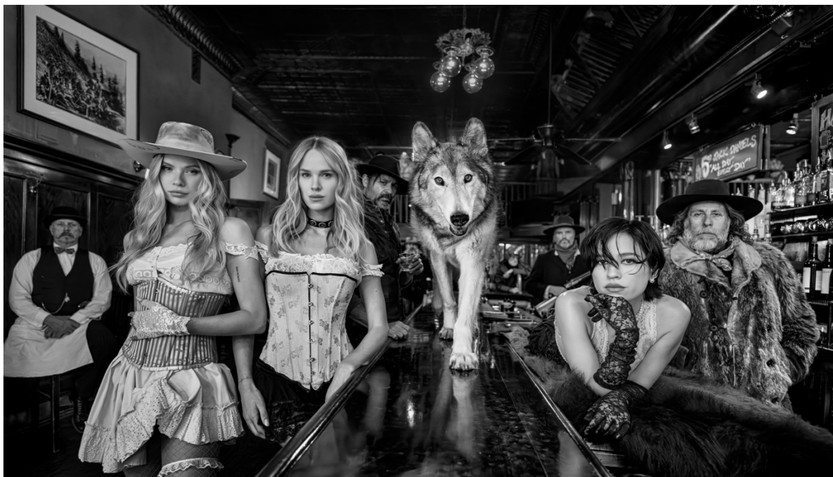
'Untamed' sold for £50,000